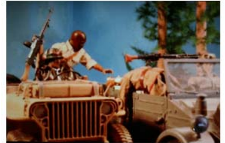
"Let's do it" and "Cairo Swordsman Takes" - by Hutt Wigley

Subsequently, these films will also tour the country in 2009.