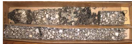
Deterioration is evident in this core sample of runway 10L/28R.

observed on the north edge of runway 10L/28R and taxiway E, in August 2006.