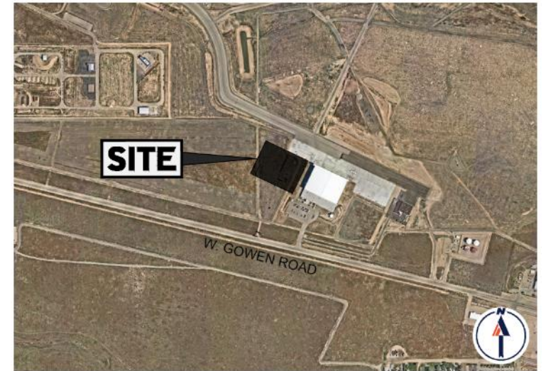
SITE VICINITY MAP